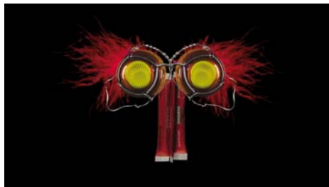
example for a face