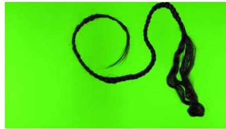
example for animating a strand of hair on the animation-table