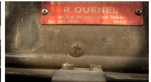
example for a photo-series ending in a close-up view for the background