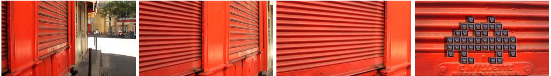
example for a scene

From now on we could split the work. Either some of you like to continue working on the animation table, while others prefer to learn some basics about the computer software After Effects. I will demonstrate how to import the photo-series of the city and the animated clips. These we need to key out to make the green background transparent and place them in front of the selected urban backgrounds. We will add a digital light und shadow. In the end each of you will need to select a background for their scene.