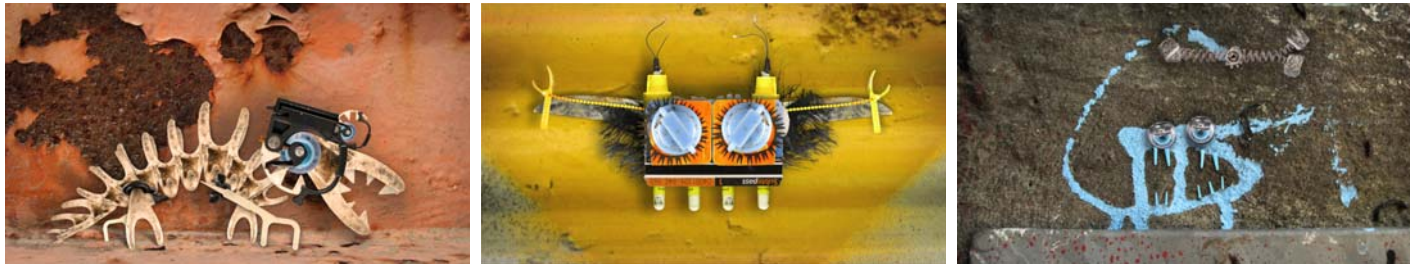
example for creatures