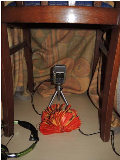
example for an improvised sound-studio

I am quite sure, there is a lot else to finish. Let`s check, if the film starts with the panel-shot down from the sky, if we end up in a close-up view, if there creatures appear, if there is a zoom-out again with a panel-shot back up to the sky, if the film has sound and if there are credits with your names. Now we are finished!