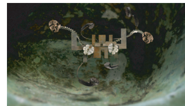
stills: „Buenos Aires Recyclers“