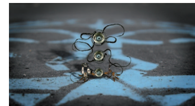
stills: „Paris Recyclers“